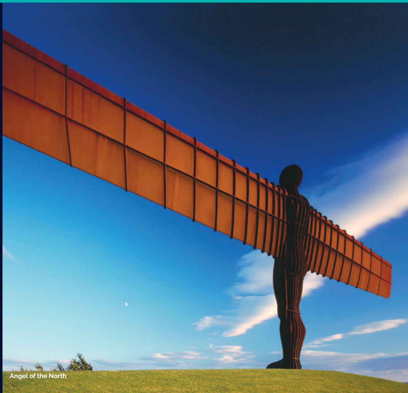
Angel of the North